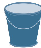
1-Year Monthly Average Indexed Account