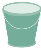
1-Year Point-to-Point Indexed Account