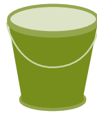
1-Year Monthly Cap Indexed Account